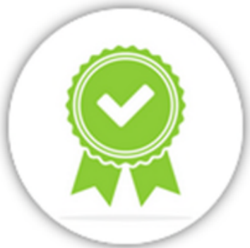
Safety & Quality