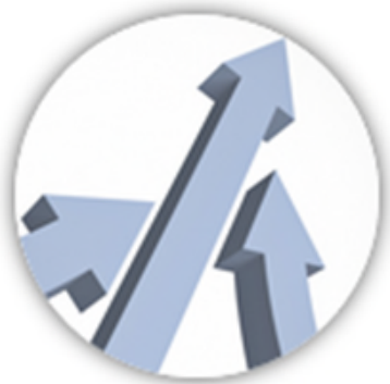
Competitiveness & Extroversion